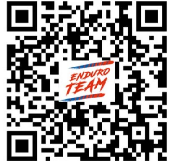
QR-Code to our profile on "komoot"