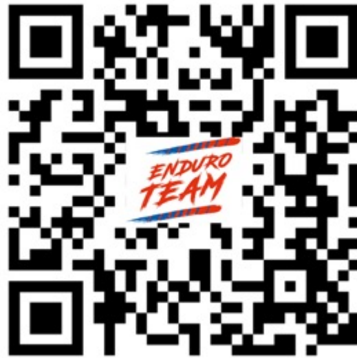
QR-Code for the Rider's Briefing (daily)